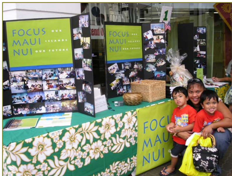
Residents stop while shopping to learn more about Focus Maui Nui.

sent to organizations in Japan and Canada by request. Recently, it helped publicize Maui County's technology activity relating to agriculture and the environment at the annual Bio2005 International Conference in Philadelphia.