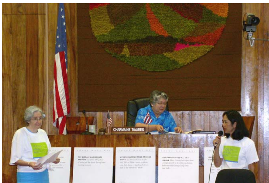
Focus Maui Nui was invited to present its findings to the Maui County Council.