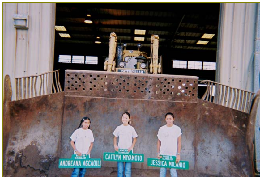
Middle school girls got a taste of what it is like to be a transportation engineer working for the County Highways department.

With WIT support, the University of Hawaii’s Society of Women Engineers (SWE) has begun to revitalize its student association starting with its October 2004 participation at the National SWE conference held in Milwaukee, Wisconsin. Six local officers attended.