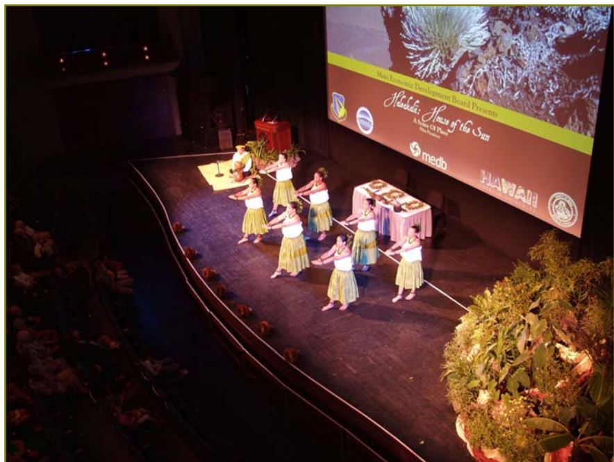
The Sense of Place film premiere was preceded by a presentation of hula kahiko by Ka Pa Hula o Ke Kula Kaiapuni o Maui.

150 conferees. In early 2005, the film debuted at the Maui Arts and Cultural Center, attracting a