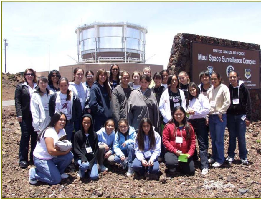
Excite campers tour the AEOS telescope at the summit of Haleakala.

The video and accompanying reference booklet are intended to enlighten the general public on the historical and cultural significance of Haleakala and includes strong archival and original footage, as well as interviews with Native Hawaiian cultural practitioners.