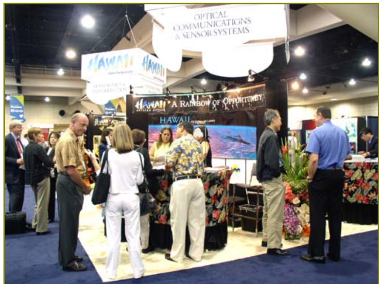
High Tech Maui discusses the business side of paradise with business prospects.

business development resources, we received great response from many of the 5000 county officials who attended.