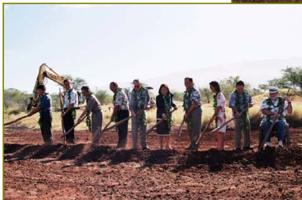
Representatives from U.S. Economic Development Administration, County of Maui, and MEDB's Board of Directors were on hand for the building groundbreaking.

Working with the Small Business Development Center, MEDB moves into its fourth year of the Maui TechOhana program, providing technology networking opportunities and business assistance services. This year, the group's breakfast meetings