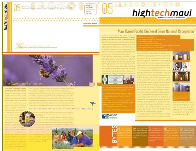
High Tech Maui's summer newsletter featured Maui's growing agri-tech industry.

Exhibiting at a variety of community events was very worthwhile in building awareness. Maui Electric Company invited Focus Maui Nui to provide a display booth at their annual four-hour community fair at the Kaahumanu Shopping Center. It also gave us a chance to test run a one-page FMN survey which 160 residents filled out. We followed this up with a presence at the Senior Fair and the Maui County Fair. Over 600 residents filled out surveys on the most important challenges facing Maui County today.