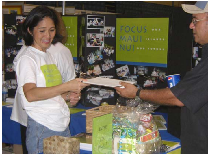
Exhibits at malls and events provide Focus Maui Nui excellent exposure in the community.