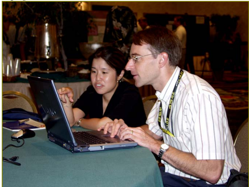
Scientists have an opportunity to network with colleagues at the AMOS Technical Conference.

AMOS is the only conference that focuses on optical space tracking. The overall technical quality of the presentations is excellent.