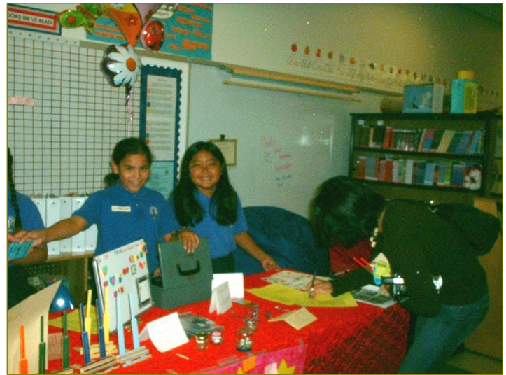
Mini-Society entrepreneurs sell their wares at Market Day.