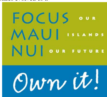
Focus Maui Nui branded the "Own It!" logo to promote a sense of individual action.

We revitalized the Focus Maui Nui website ( www.focusmauinui.com ), giving it a more engaging face and making it much more interactive. We have continued to add reference documents to the Resources section that relate to the five key strategies.