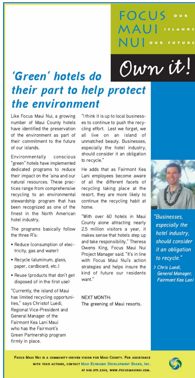
Focus Maui Nui weekly column featured in The Maui News