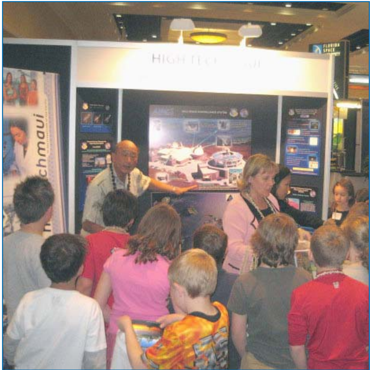
Taking the High Tech Maui message to the National Space Symposium Conference