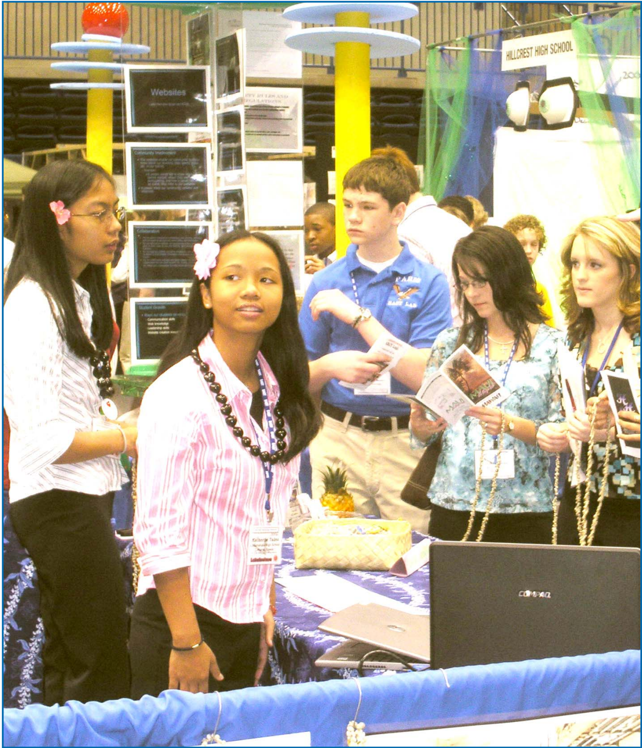
Lahainaluna High School students participate in national EAST Conference