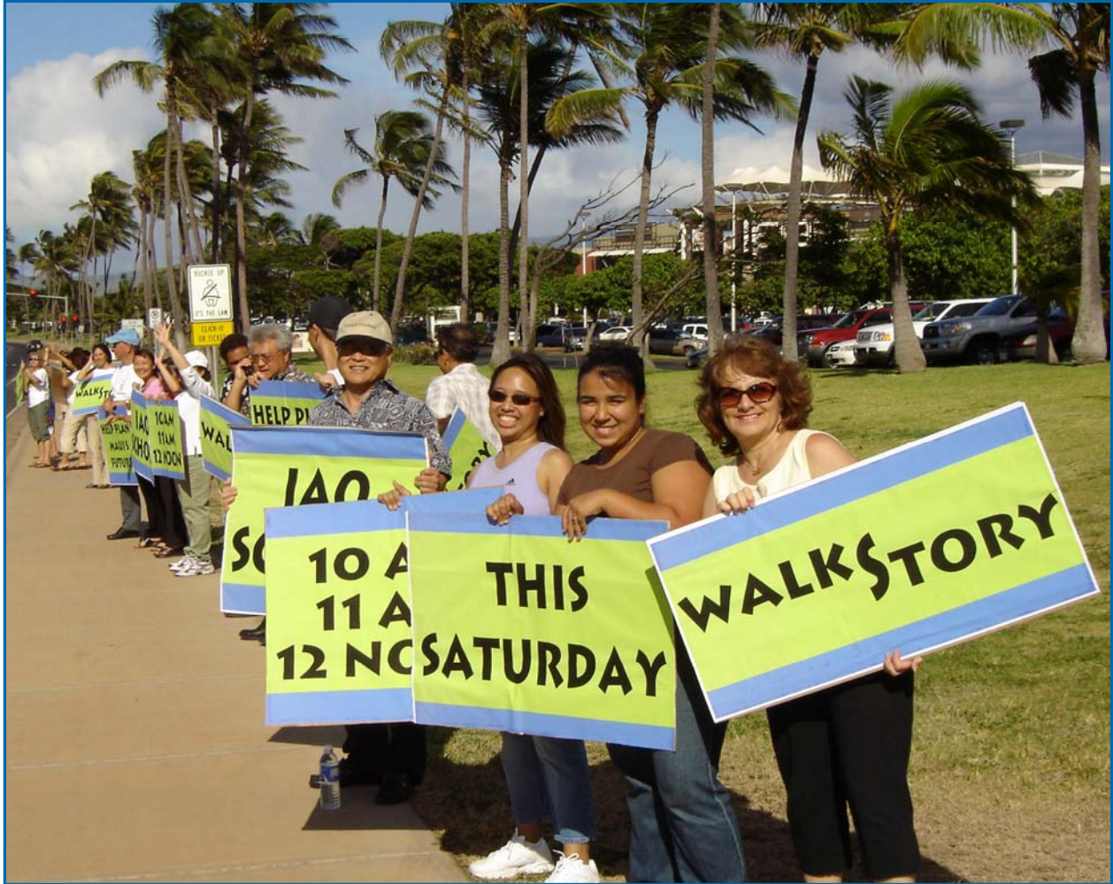
Focus Maui Nui supporters sign wave before WalkStory event