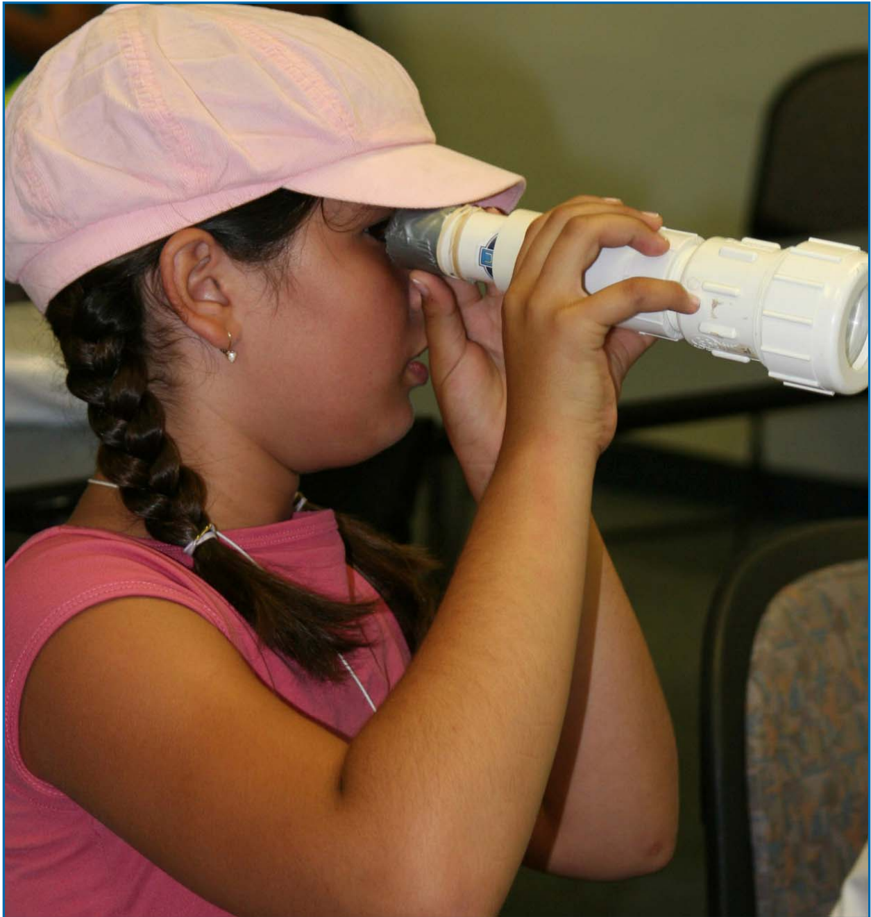
An Excite Camper tests her PVC telescope