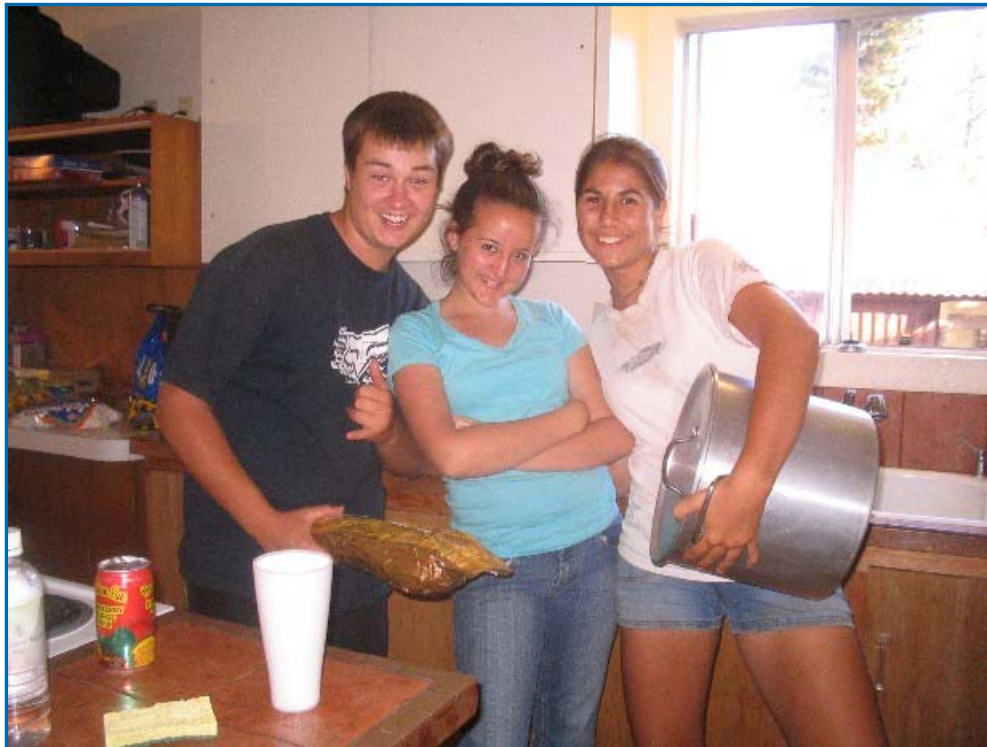
Focus Maui Nui Youth Alliance experience life in Lanai