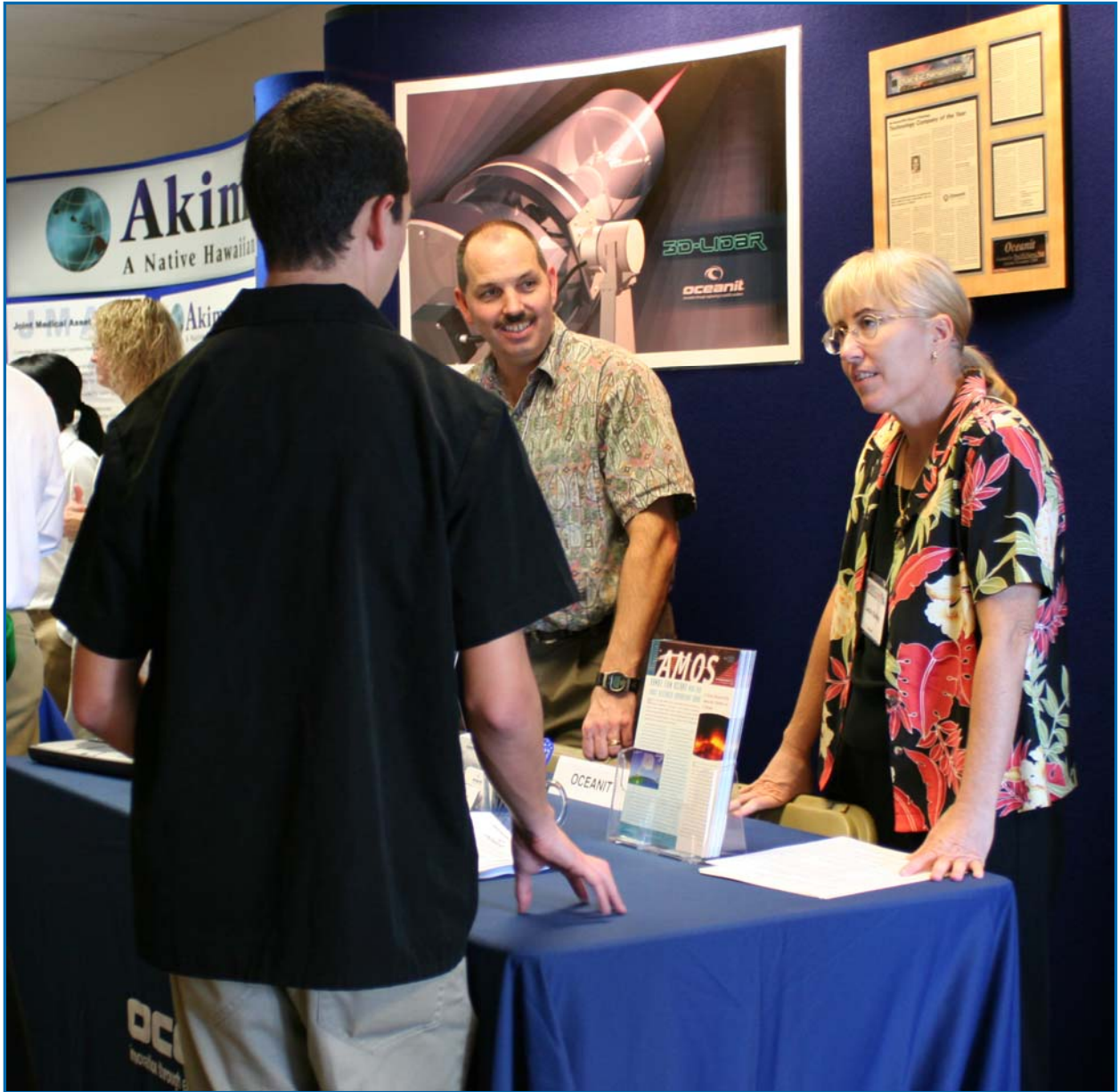
Oceanit talks with prospective candidates at High Tech Maui Holiday Job Fair