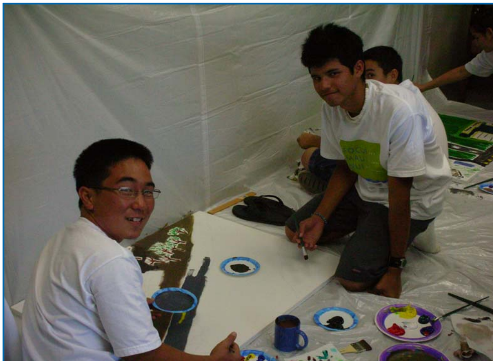
Focus Maui Nui Youth Alliance paint their vision for Maui's future