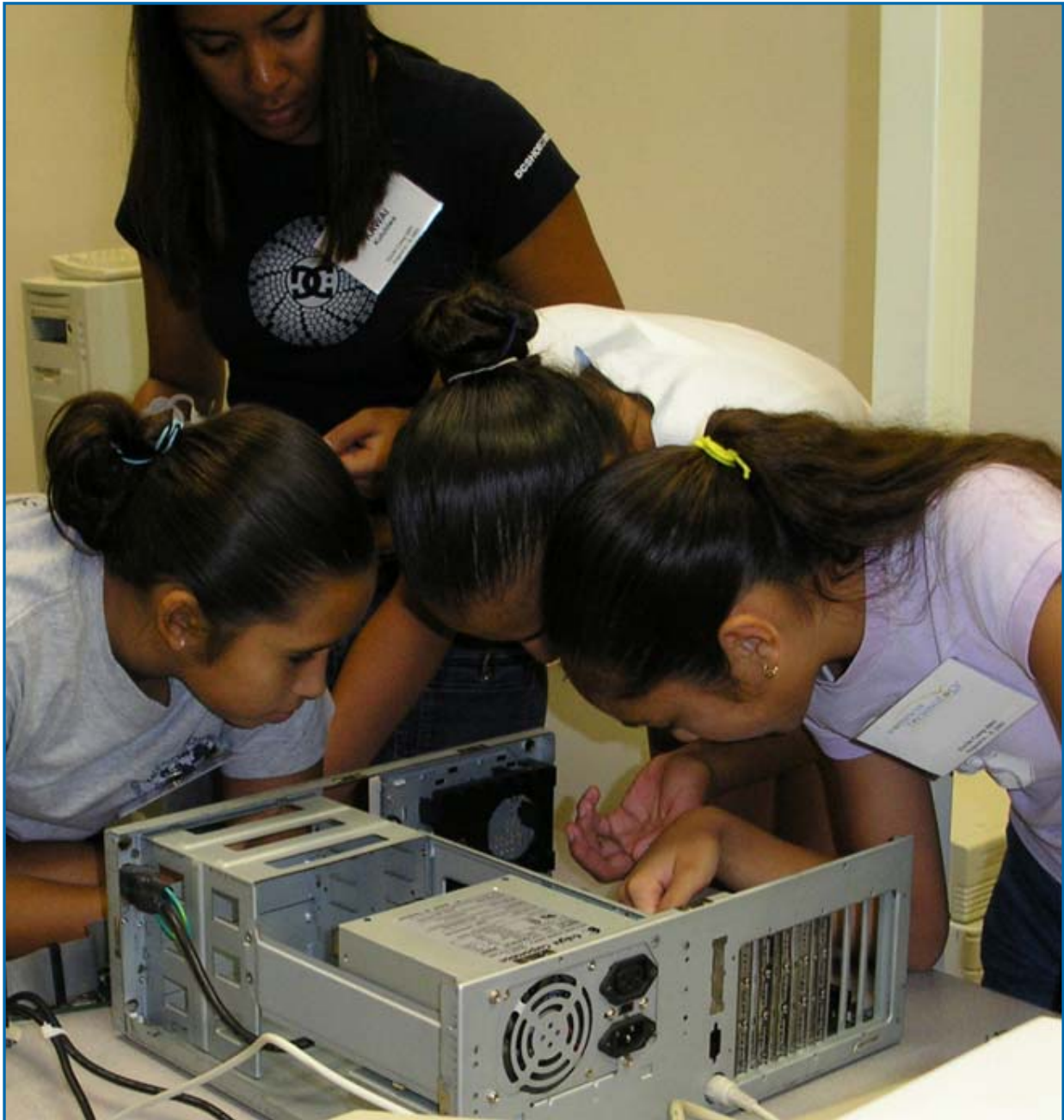
Middle school Excite Campers learn about the inner workings of a computer by taking one apart