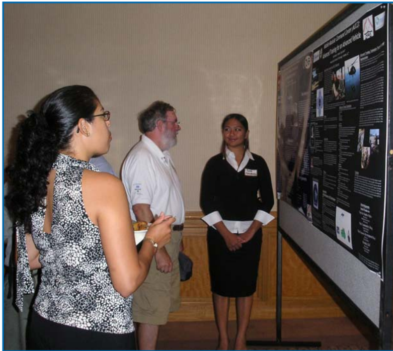
Akamai Intern presents results of her work to participants at the 2005 AMOS Conference