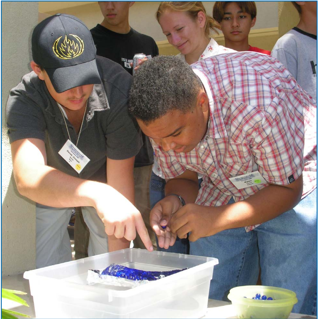
Hands-on activity demonstrates the principle of displacement at Tech Careers Day: I am the future