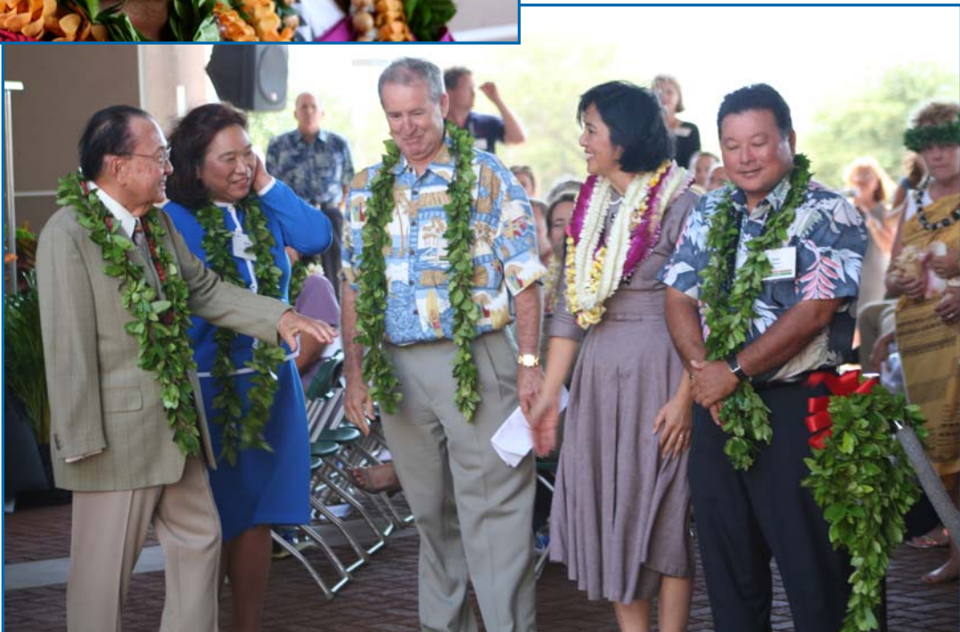
Ke Alahele: The MEDB Center commemorated its opening with a traditional blessing and program