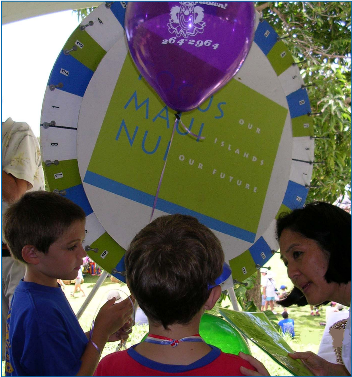
Focus Maui Nui – Spin the Wheel and learn about our community