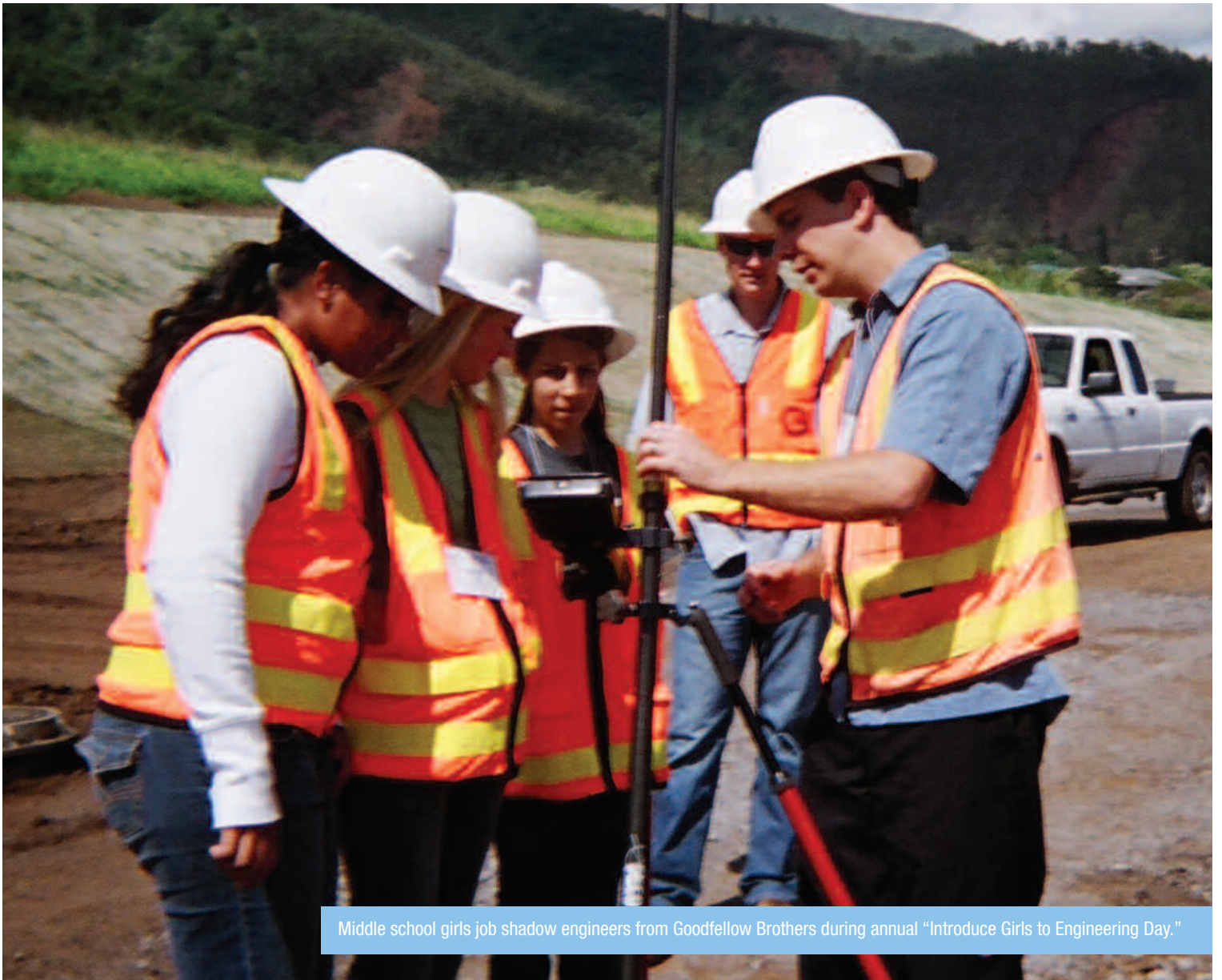
Middle school girls job shadow engineers from Goodfellow Brothers during annual "Introduce Girls to Engineering Day."