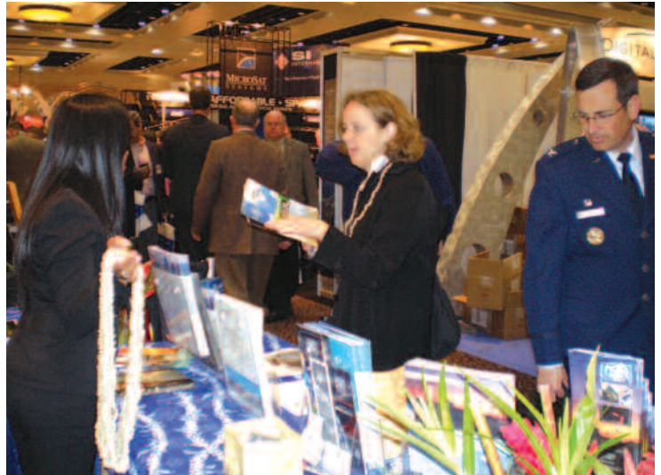
Exhibit at National Space Symposium