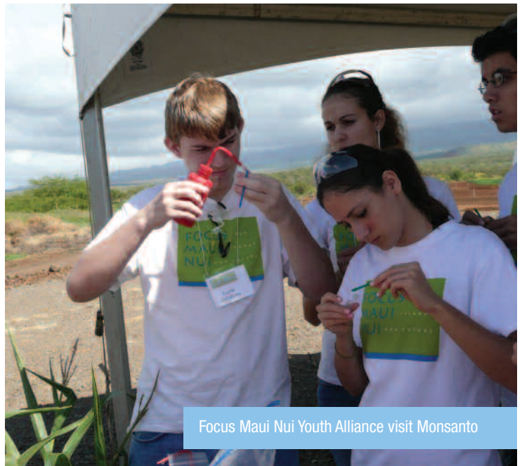
Focus Maui Nui Youth Alliance visit Monsanto