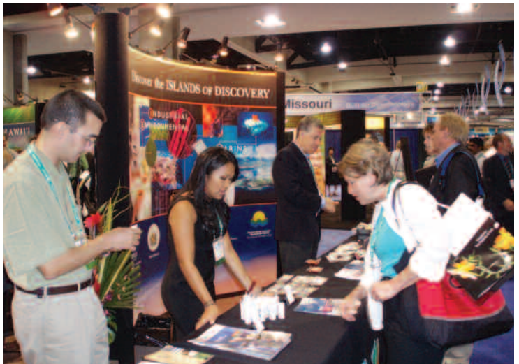
MEDB showcases Maui's diversified agriculture and biofuel industry at 2008 Bio International