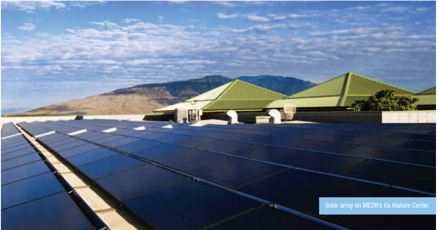
Solar array on MEDB's Ke Alahele Center