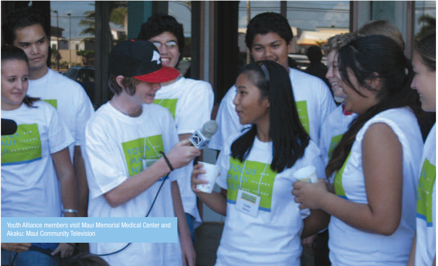
Youth Alliance members visit Maui Memorial Medical Center and Akaku: Maui Community Television

“Focus Maui Nui has begun to influence many aspects of life on our islands...from major employers to small community-based organizations to candidates for public office...”