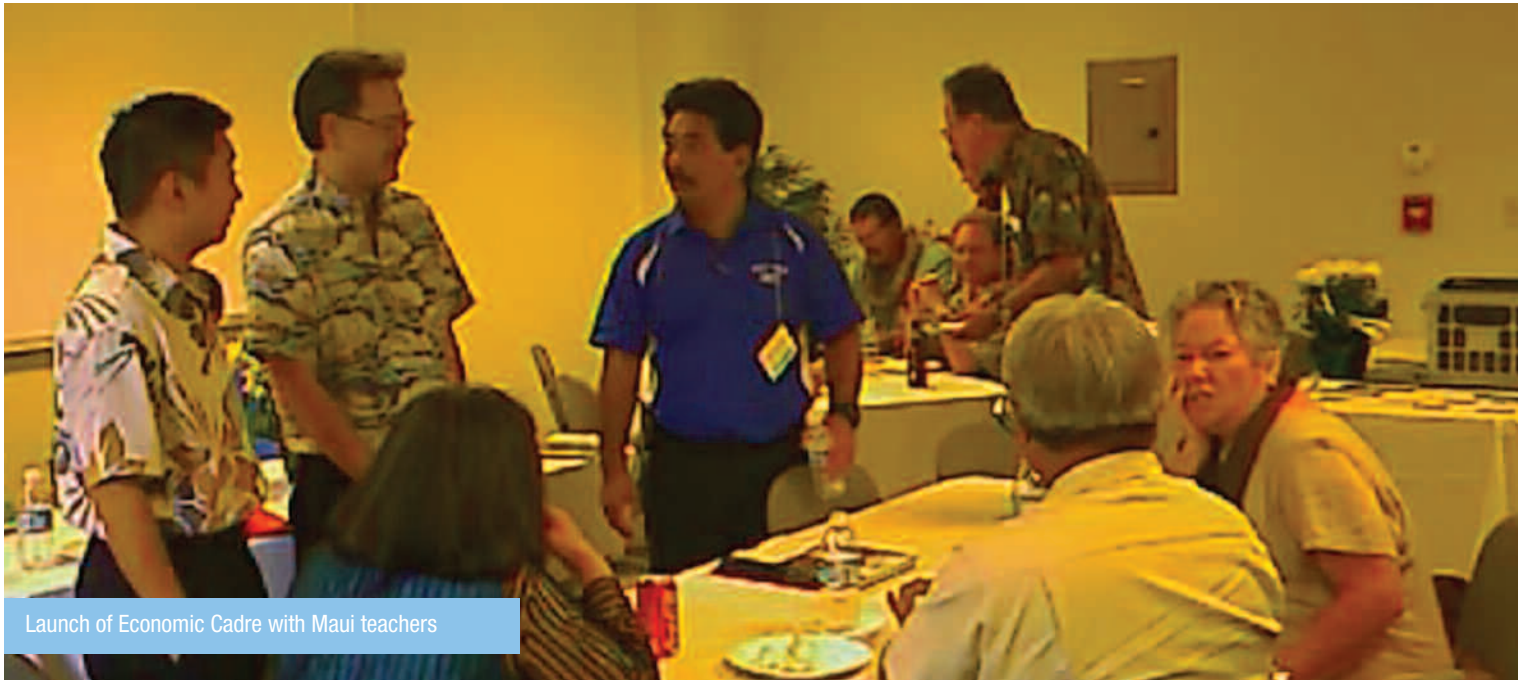
Launch of Economic Cadre with Maui teachers

MEDB was pleased to begin a new funding partnership with the Directed Energy Professional Society (DEPS). As part of its education to workforce mission, MEDB's Women in Technology Project provided the grant and fiscal management for DEPS funding to expand equipment and training capacity in the Electronics and Computer Engineering Technology Lab (ECET) at Maui Community College.